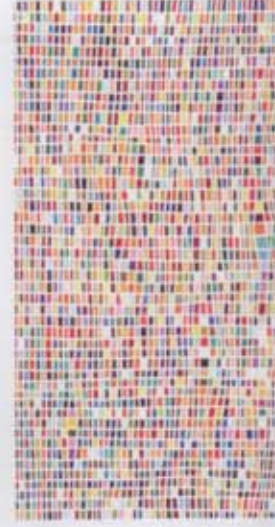
3825 Cores, 2009.